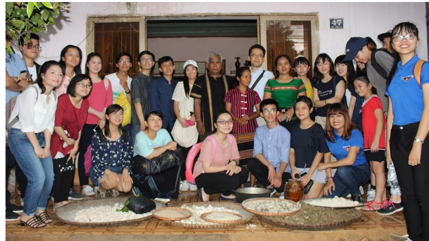
At the headman's Stieng people house